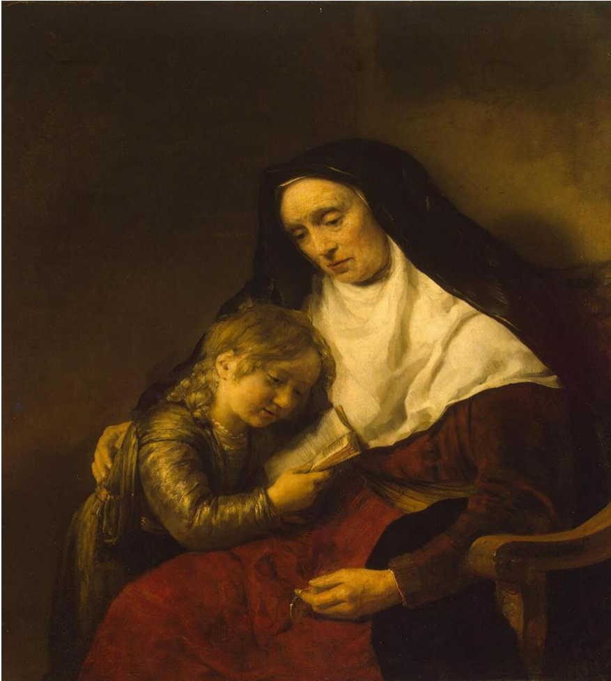
Rembrandt's Timothy and his grandmother , 1648.

Sharing the Gospel and God's love through praise, worship and service to others